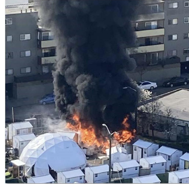
Pallet Community Fire Oakland, California

Unfortunately, Pallet Shelters have a negative track record and propensity for fires. Fires have been reported at Pallet sites in Oakland, Los Angeles, and Banning.