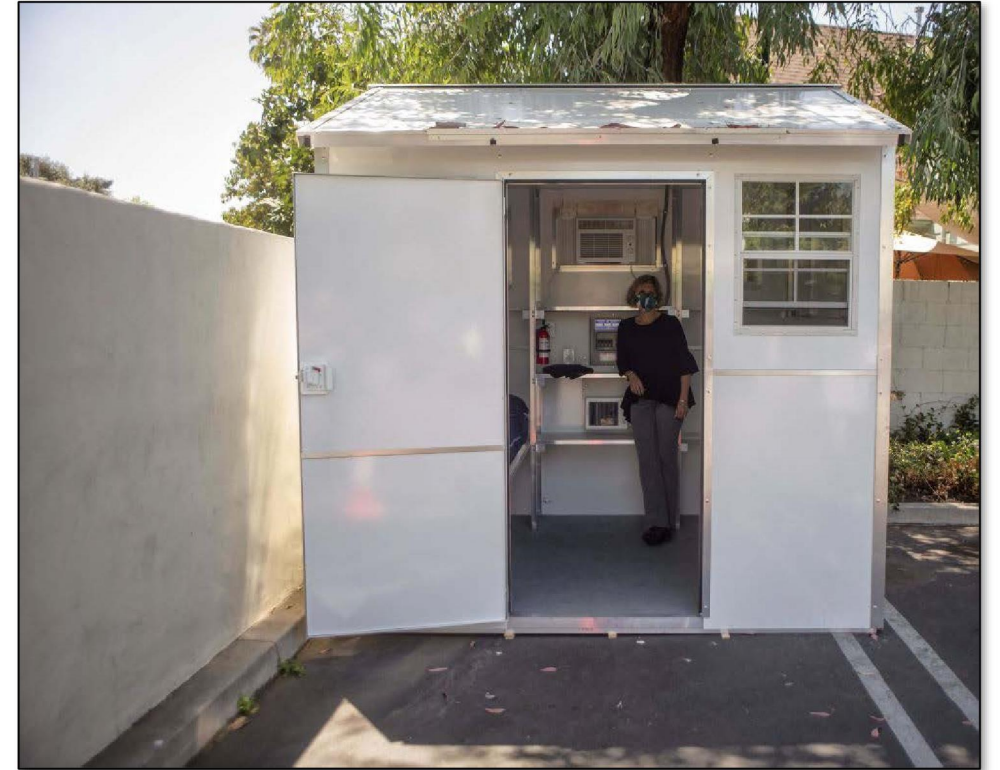
Pallet Community, California

Staff could have difficulty in making sure that clients are protected from outside elements, such as weather, crime, and health due to the lack of visibility that comes with individual private spaces.