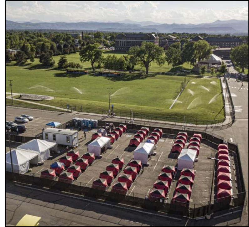
Tent Encampment, Colorado

A sanctioned encampment does not align with the City's initiatives, and Mayor's core values.