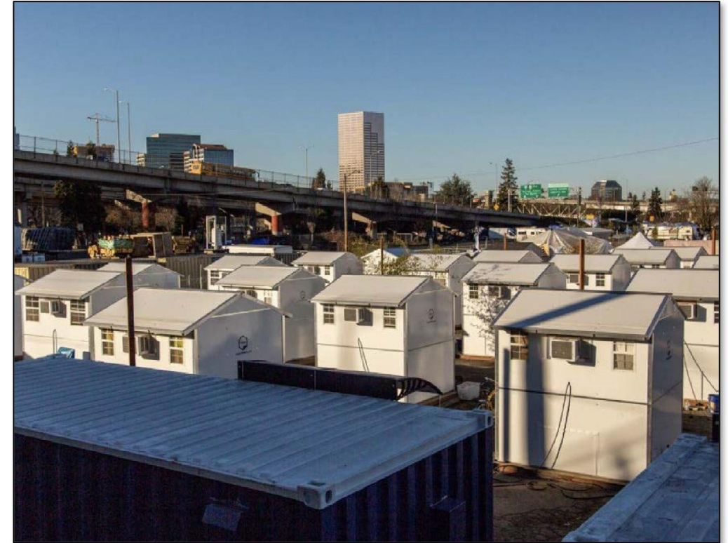
Pallet Community, Oregon

A pallet community typically refers to a housing arrangement where individuals or families reside in small structures or tiny homes made by Pallet Shelters.