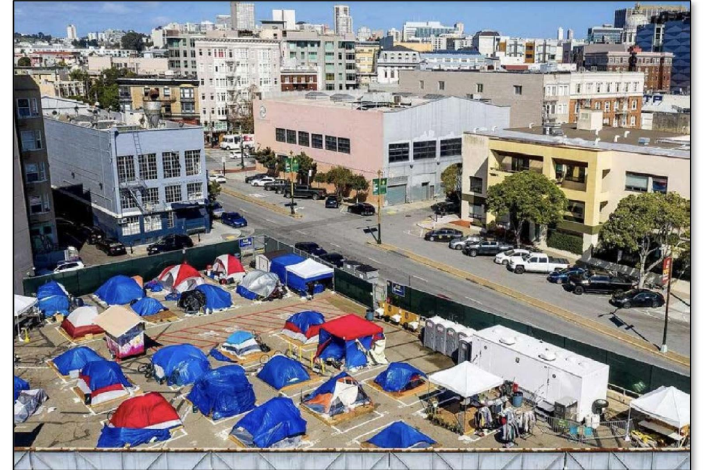
Regulated Tent Encampment, California

A regulated tent encampment is a designated area where individuals or groups can set up temporary shelters, typically in the form of tents, in a controlled and regulated manner.