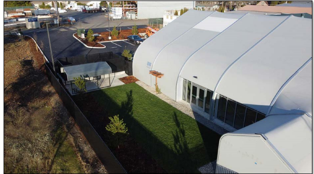
Sprung Shelter, Washington

When designed properly, a shared, congregate living facility can help create a sense of shared purpose & belonging and in general, larger buildings feel more traditional than individual sleeping units. Sprung Shelters are flexible in design to allow traditional architectural components to be integrated like glass entry doors, storefront glazing, and fun curves, alcoves, and entry ways.