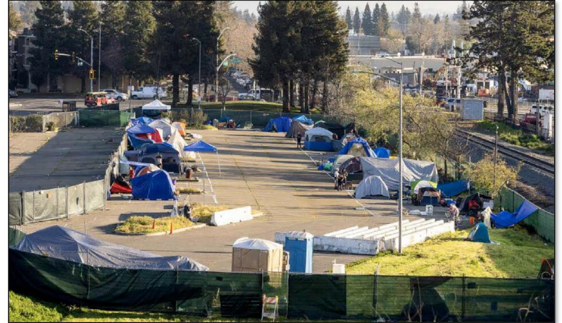
Tent Encampment, California

Tent encampments are not comparable to Pallet communities and Sprung shelter sites for the following reasons: they don't provide shelter, they don't fall in line with national definitions of shelters, they are unhealthy, unsafe, and they become a city sponsored public health situation further perpetuating the stigma of homelessness.