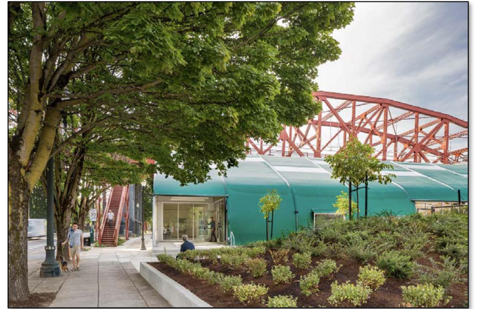
Sprung Shelter, Oregon

The Sprung Shelter option offers a regulated open space, where climate controls and thus disease prevention is managed at a staff level, versus an individual (resident) level, adding to the positive health impacts of the facility.