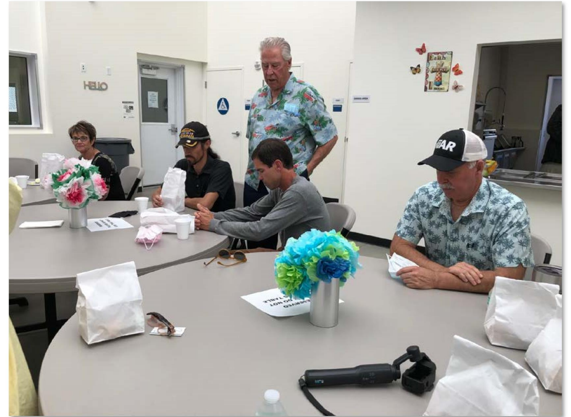
Community Faith Meeting, California

RPM Team operates as both a consultant for homelessness programs and a turnkey design firm involved in developing and constructing Navigation Shelters. Specializing in pre-engineered and prefabricated structures, we deploy teams faster than traditional EPC firms while remaining an economical option for planning, designing, and constructing housing projects.