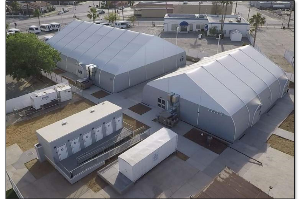
Sprung Shelter, Washington

Sprung Shelters are used as a solution for providing temporary congregate housing quickly and efficiently for emergency response or initiatives addressing homelessness.